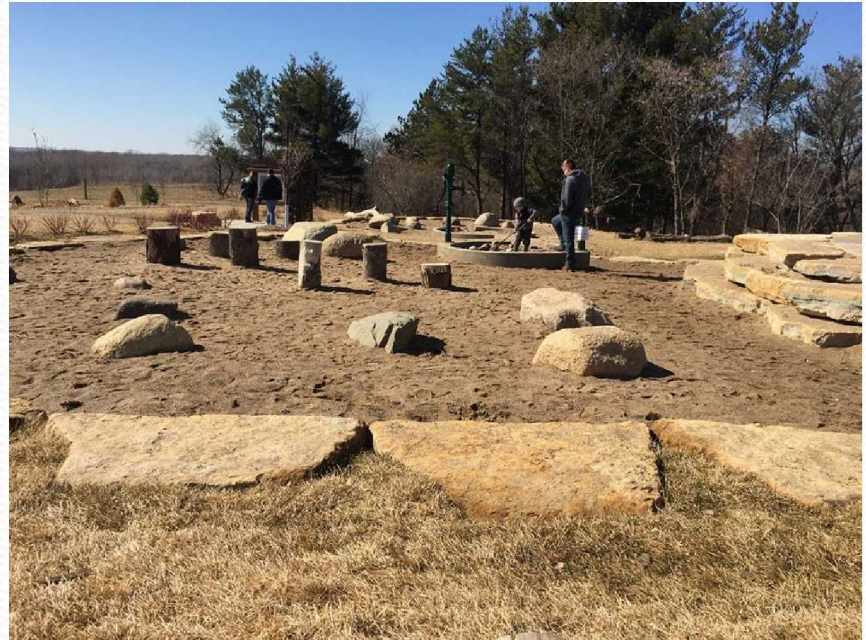
Dakota County – Whitetail Woods Regional Park